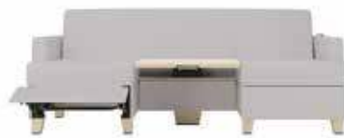
62272T custom with ottomans