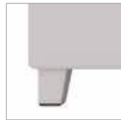
metal 5 finishes