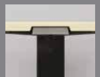
table release lever