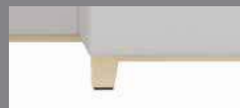
wood trim rail