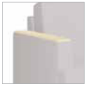
thermoform or wood