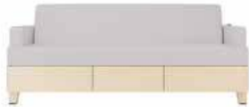
62272 custom with drawers