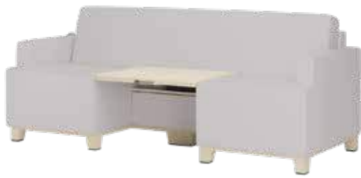
classic – a simple full front design

dine, visit, work, sit, recline and sleep in just 20 square feet