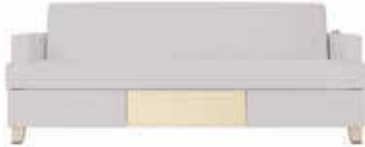
62272 custom with ottomans and drawer