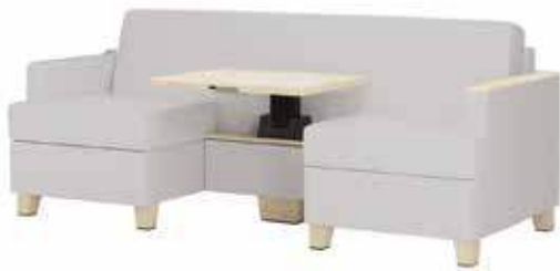
custom – separate seat cushions accommodates multiple base options