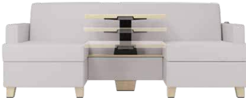
3 table heights

table can be used for additional seating, up to 500 lbs. when in lowest position