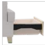
drawer face wood, thermoform or fabric