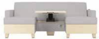
62272T custom with drawers and power outlet