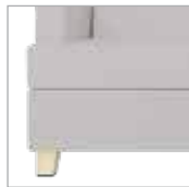
blank panel wood, thermoform or fabric