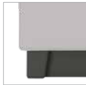
plinth classic only