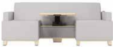
62172T classic with upholstered arm