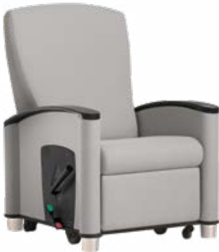
53W981 patient recliner, wide