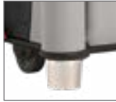
faux feet metal or wood