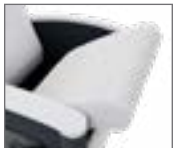
quick release seat