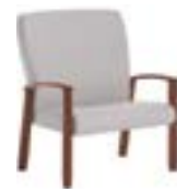
53471WB30 30" patient chair