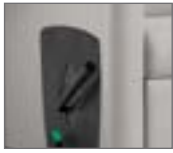
recessed ottoman handle