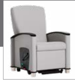
Orthopedic Higher seat minimizes effort to stand or sit down