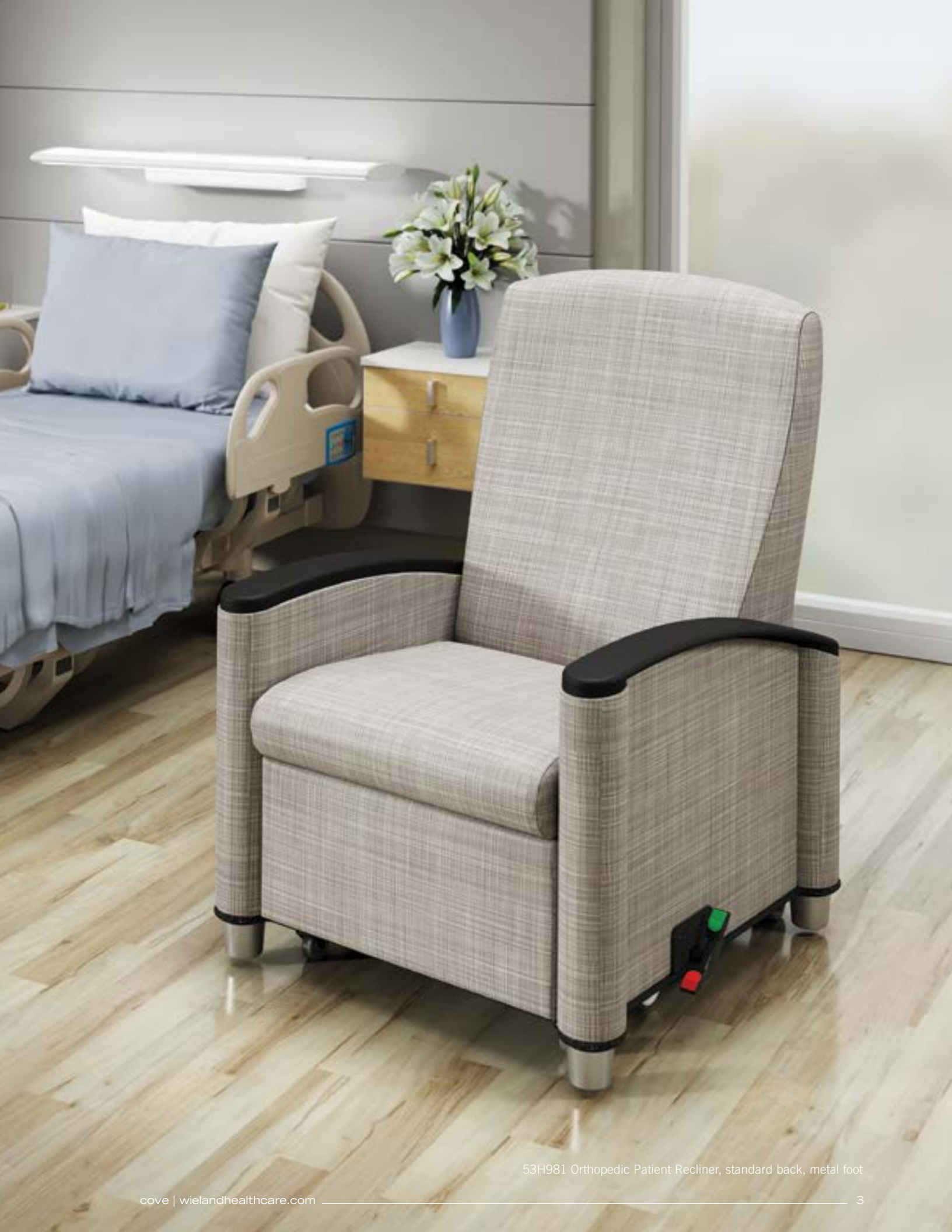
53H981 Orthopedic Patient Recliner, standard back, metal foot