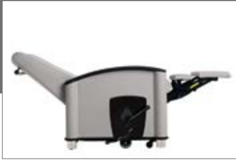
Sleep Designed for patient or overnight guest use