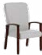
53471UB22 patient chair with urethane arm caps