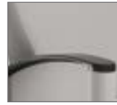
wood, urethane or solid surface arm caps