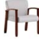
53471WB30 30" patient chair