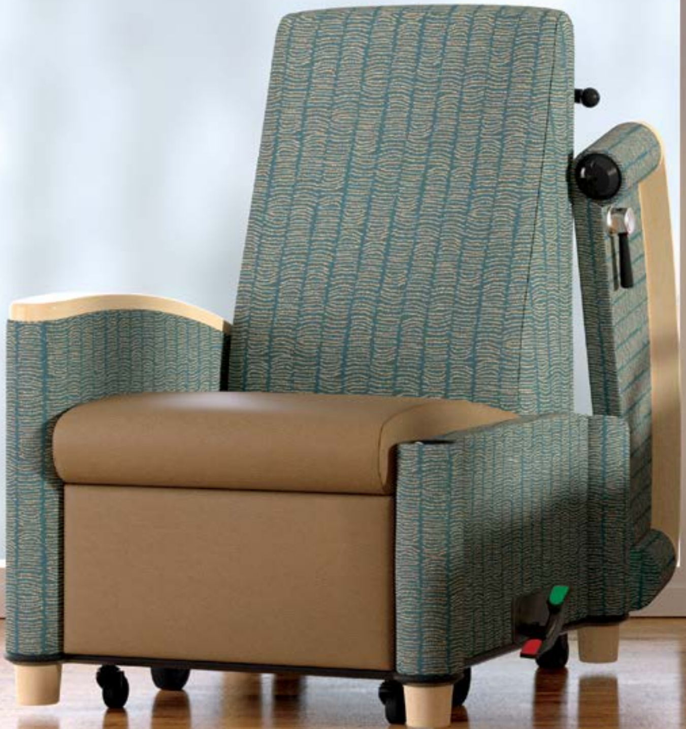
53981 Patient Recliner, straight back, transfer arm, pushbar, wood foot