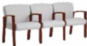
53410-TW 3-seat tandem