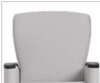
standard back not available with transfer arm option