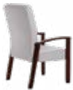
53471WB22 patient chair