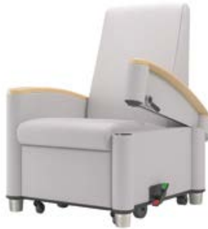
53W981 patient recliner, wide