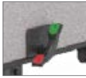
caster brake on both sides of chair