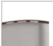
arm restraint cap