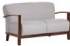
53L412W lounge loveseat