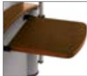
flip table half version shown