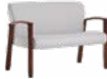
53411WB40 40" loveseat