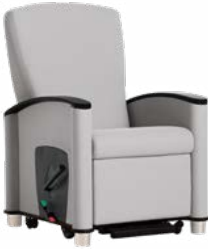
53H981 orthopedic recliner