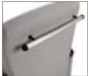
pushbar metal or wood