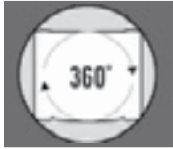
360° turning radius