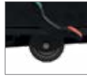
sealed quiet casters