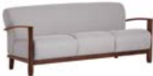
53L413W lounge sofa