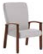
53471WB22 patient chair