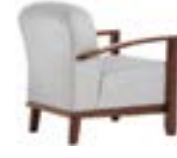
53L411W lounge chair