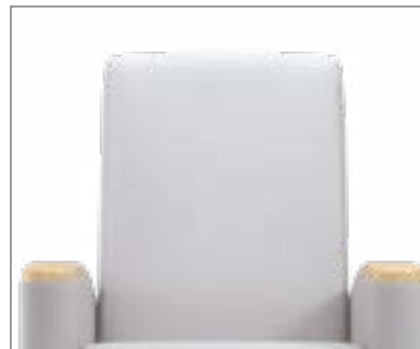
straight back available on all models with or without transfer arm option