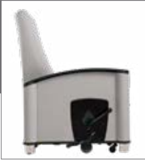
Patient Decades of proven dependability

Cove recliner provides precise movement with its unique Trac-Rite casters, zero turn radius and central brake system. Cove's effortless, one-handed steering during transport allows nurses to remain focused on patient care.