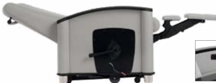
53981S sleep recliner