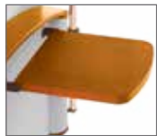
flip table solid surface, thermoform or laminate