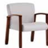
53471WB30 30" patient chair