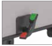
central brake on both sides of chair