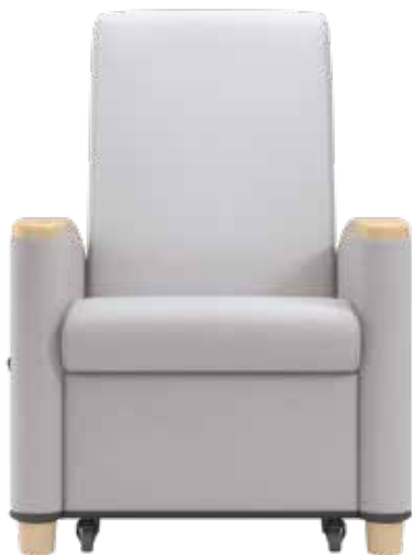
53W981 patient recliner, wide