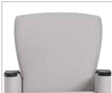
standard back not available with transfer arm option