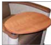
fold-down table solid surface, thermoform or laminate