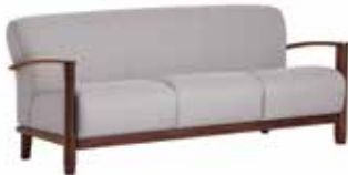
53L413W lounge sofa