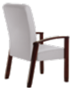
53471WB22 patient chair