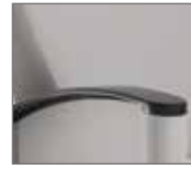
wood, urethane or solid surface arm caps