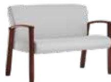
53411WB40 40" loveseat