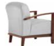
53L411W lounge chair