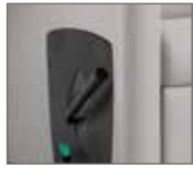
recessed ottoman handle