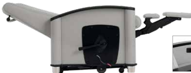
53981S sleep recliner