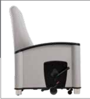
Patient Decades of proven dependability

Cove recliner provides precise movement with its unique Trac-Rite casters, zero turn radius and central brake system. Cove's effortless, one-handed steering during transport allows nurses to remain focused on patient care.