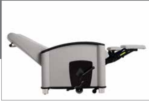
Sleep Designed for patient or overnight guest use