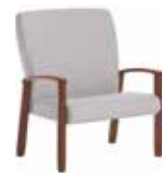
53471WB30 30" patient chair