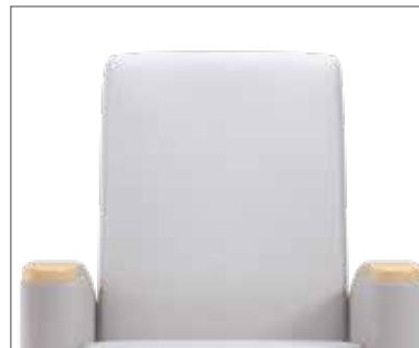
straight back available on all models with or without transfer arm option