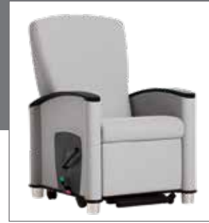
Orthopedic Higher seat minimizes effort to stand or sit down