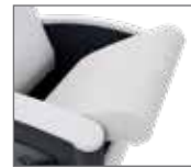
quick release seat