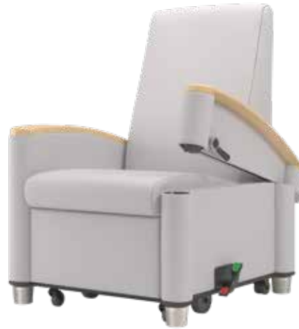
53W981 patient recliner, wide