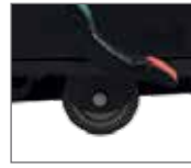
sealed quiet casters