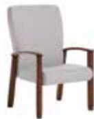
53471WB22 patient chair