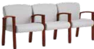
53410-TW 3-seat tandem