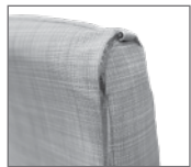
back edge wall guard