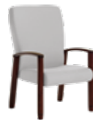
53471UB22 patient chair with urethane arm caps