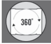
360° turning radius