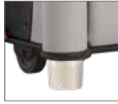
faux feet metal or wood