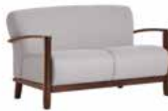
53L412W lounge loveseat