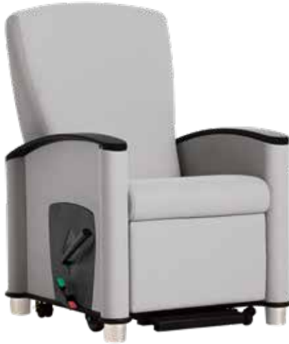
53H981 orthopedic recliner