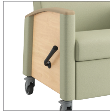
arm panel thermoform (standard)