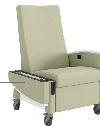
14981 single transfer arm

fold down arm for patient transfer in both the seated and supine position