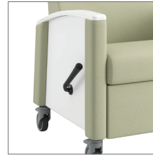
arm panel solid surface