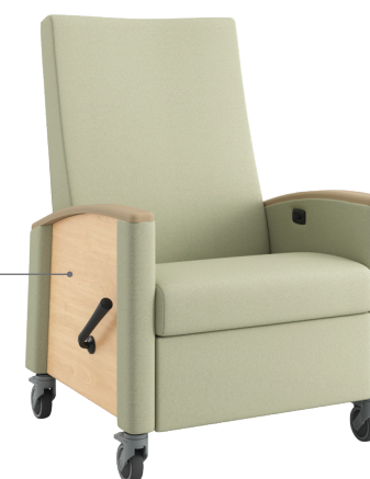
14W981 recliner, wide

hard surface arm panels (solid surface or thermoform) are easy to wipe down and impervious to harsh healthcare cleaners