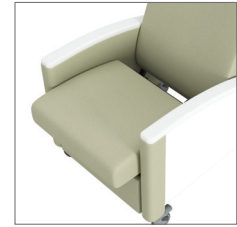
quick release seat