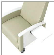
half flip table thermoform or solid surface