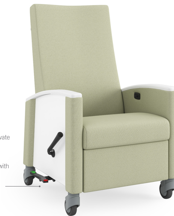
14981 central brake

Push red pedal for exceptional braking power; green to activate auto-align tracking casters; or neutral position for casters with zero-turn radius