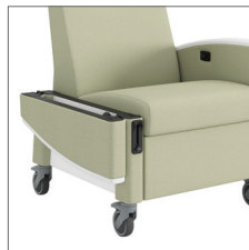
single transfer arm available either side