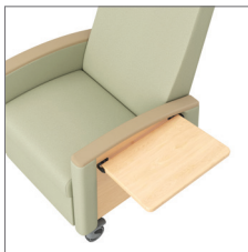
full flip table thermoform or solid surface