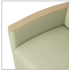
urethane arm cap (standard)