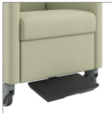
footrest black only