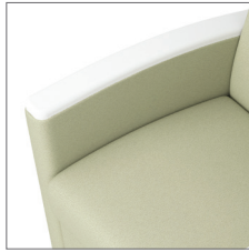
solid surface cap