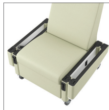
double transfer arm