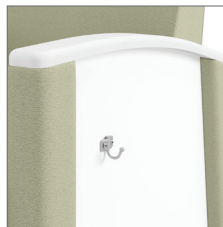
foley bag hook