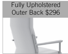
Call for COM yardage. Standard on Motion Chairs at no upcharge.