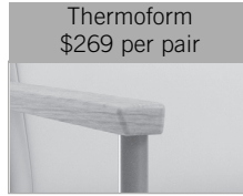
See ordering information for color options.