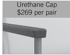
Specify black, sable or dove.