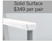
Specify solid surface color.