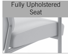
Call for COM yardage.