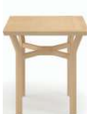
6300001 end table