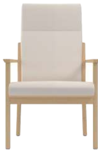
6347122 patient chair