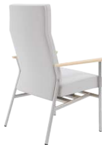
63571M22 high back motion chair