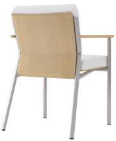
63541H22 easy access chair