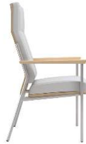
6357122 patient chair