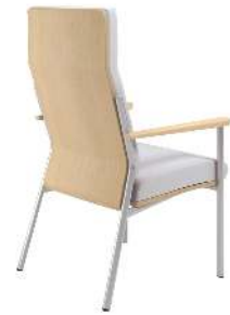
6357122 patient chair