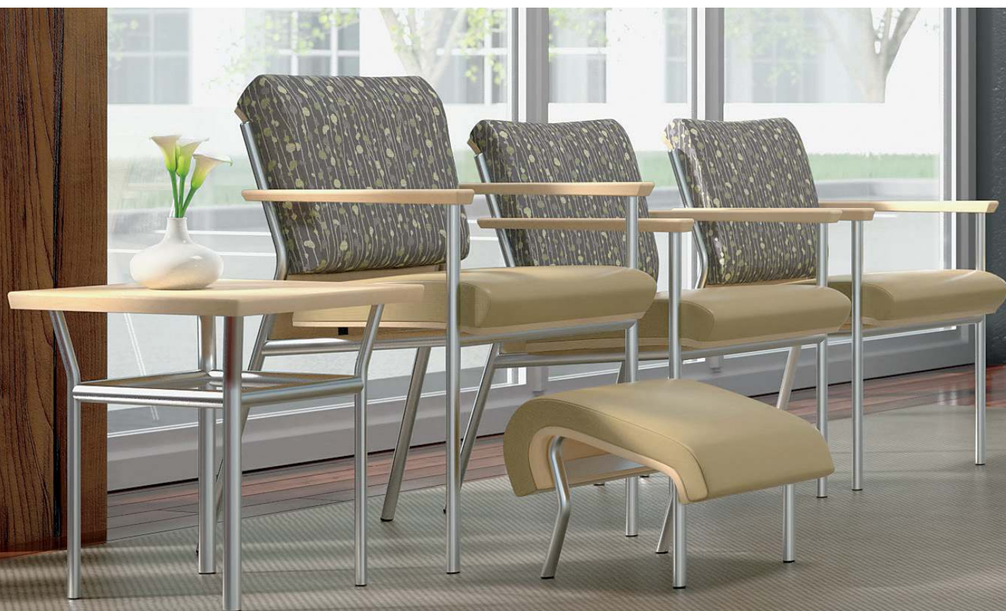
trace easy access chair

Shorter seat depth aids orthopedic surgery patients in comfort. 3" higher seat height and level pitch meet post surgery restrictions.