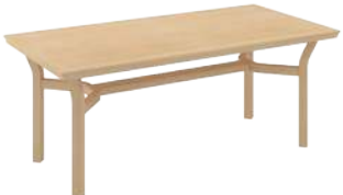
6300002 coffee table