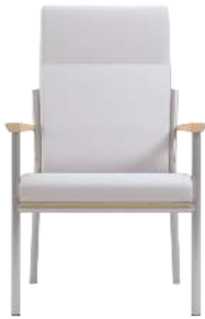
6357122 patient chair