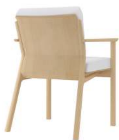
63441H22 easy access chair