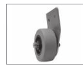
tip back caster