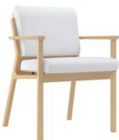
63441H22 easy access chair