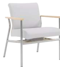
63511M22 low back motion chair