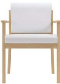
63441H22 easy access chair