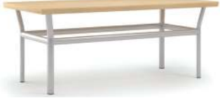
63500052 coffee table