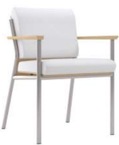
63541H22 easy access chair