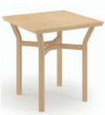
6300001 end table