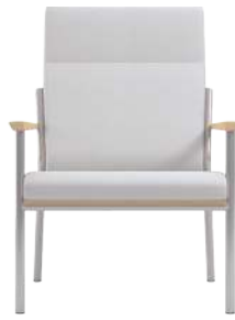
6357130 bariatric patient chair