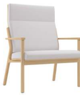
6347130 bariatric patient chair