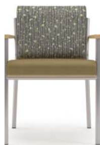
63541H22 easy access chair