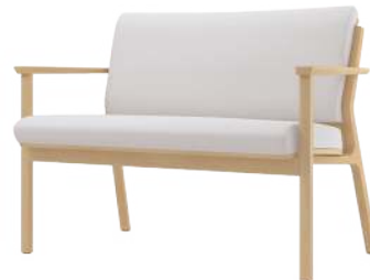
6341140 chair, 40" seat width