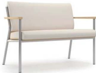
6351140 chair, 40" seat width