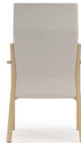
6347122 fully upholstered back