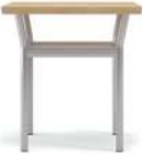
63500051 end table