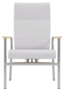
63571M22 high back motion chair