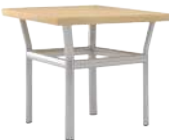
6300051 end table