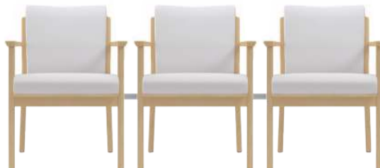
6341122 shown with ganging assembly