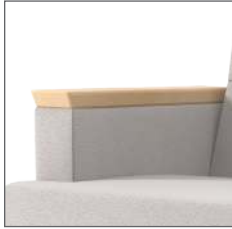
arm cap Wood, urethane or thermoform