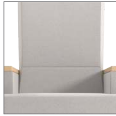
faceted back design