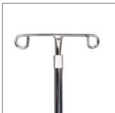
IV pole Standard