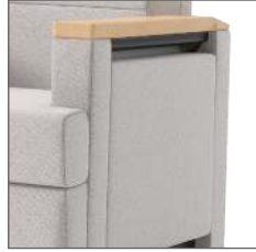
arm insert panel Fabric, thermoform, or wood