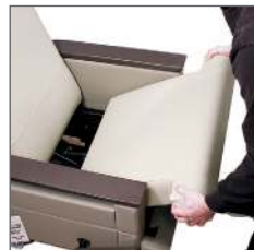
quick release seat