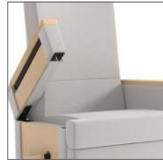
transfer arm Specify right, left, or both