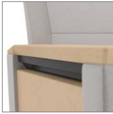
reclineAssist bar Sleep and Trendelenburg only