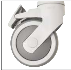
locking casters Black or grey