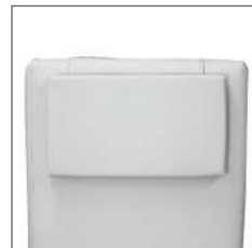
headrest Specify fabric