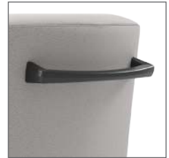
pushbar Black, sable, dove, or khaki