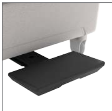
retractable footrest Black only