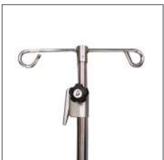
trigger IV pole Chrome or stainless