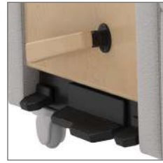
controlCove Black, sable, dove, khaki or silver metal powder coat