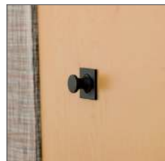
foley bag hook Black only