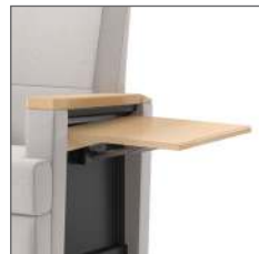
flip table Thermoform or wood; available on right side only