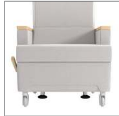
intelliTrac™ with safeBrake Specify black or grey casters