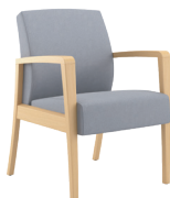
68MN01MR flex back chair