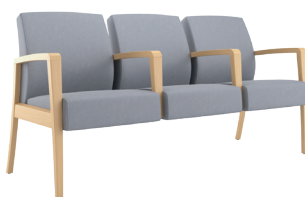
68MN13M sofa short center arms