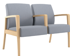
68MN12M loveseat short center arms