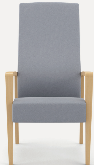
68MN01HR flex back chair, high back