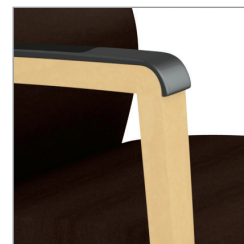
urethane arm cap available in black only