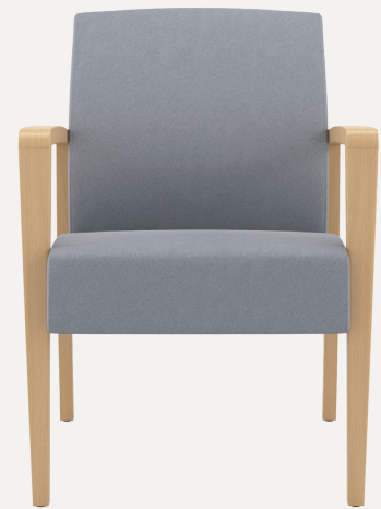
68MN01MR flex back chair

Find the design solution for your patient and waiting room with Monroe's broad range of seating choices. These choices include high back and bariatric chairs, as well as flex back models in two different back heights.