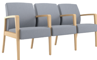
68MN23M 3 seat tandem