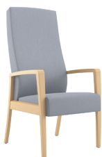
68MN01H patient chair