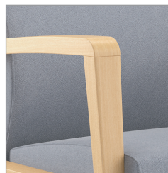
no arm cap standard