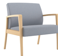
68MN01G bariatric chair