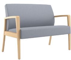
68MN01L loveseat, continuous seat