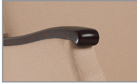
wood arm caps