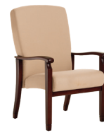
54471WB22 patient chair