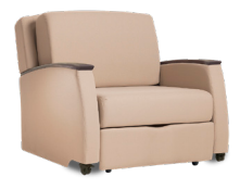
54841WM30 sleep chair