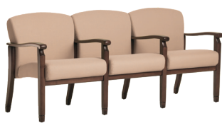
54410-3TW 3 seat tandem