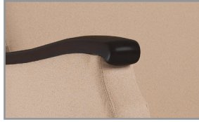
urethane arm caps