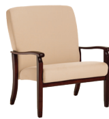
54771WB30 wallsaver bariatric patient chair